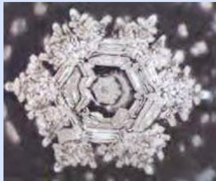
Water Molecule After Prayer